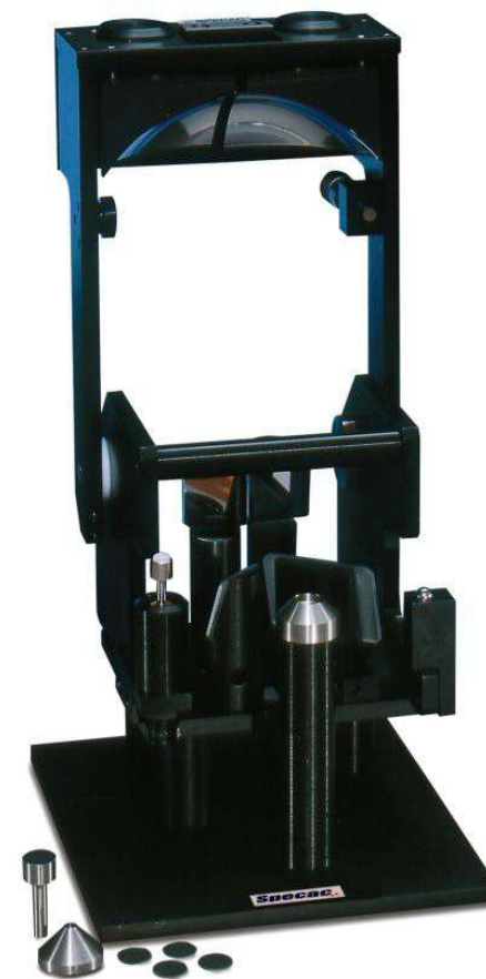
Figure 1: Specac Selector Diffuse Reflectance Accessory

Chrysotile may also be distinguished from the inosilicates by the absence of absorption bands between 950 to 750cm -1 . Crocidolite may be distinguished from amosite by bands at 870, 690, and 580cm -1 and the absence of strong bands at 1000 and 460 cm -1 .